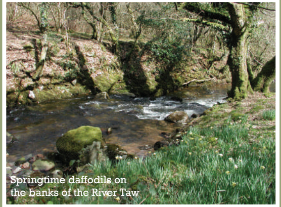
Springtime daffodils on the banks of the River Taw